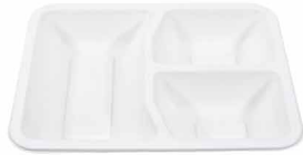
3 compartment meal tray