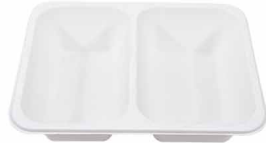
2 compartment meal tray