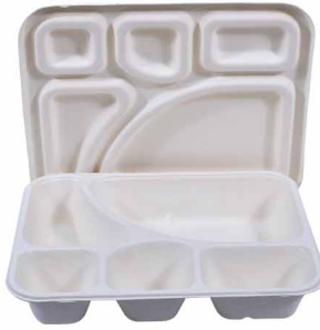
5 compartment meal tray with lid