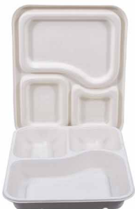
3 compartment meal tray with lid