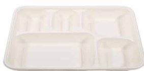
5 compartment meal tray with lid